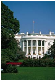
In the USA, President Bush has asked all Americans to form a National Neighborhood Watch to fight terrorism.

“In all aspects of crime prevention it is important to understand your own survival signals.”